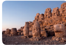
Mount Nemrut Ağrı

Which one of the matchings below is incorrect ?