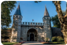
Topkapı Palace İstanbul